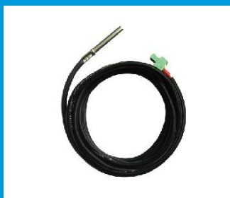
RTS300R47K3.81A Remote temperature sensor (3m)